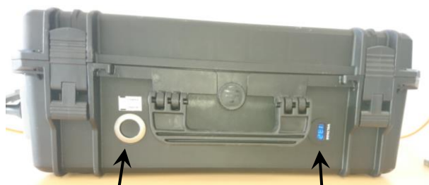
On / charge button