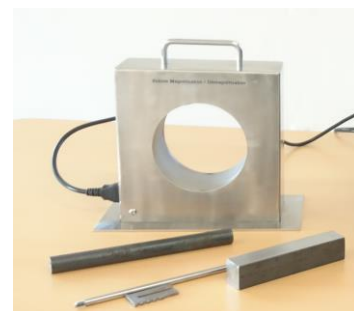
Can also be used with magnetization / degaussing coil