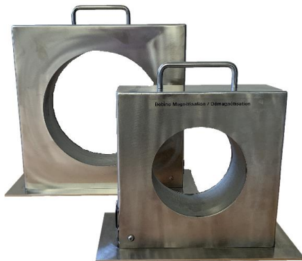
magnetising/demagnetising coils from 210mm to 600mm