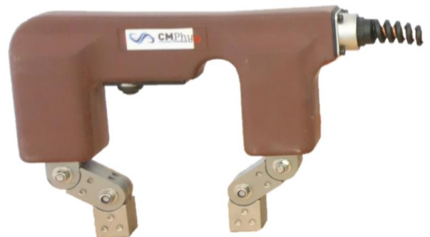
Yok very low frequency