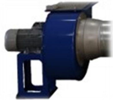
Air extraction positioned outside